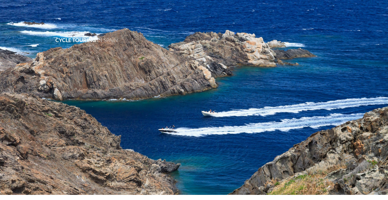
CAPE OF GREUS GIRONA

The route is 2,000 km long and some sections coincide with the GR routes or shorter distance trails. 35% of the route goesthroughprotected nature areas. You'll be able to discover the wild beaches in the Cabo de Gata-Níjar Nature Reserve and Biosphere Reserve in Almería, look out over the Strait of Gibraltar and visit the picturesque towns and villages in the Alpujarra mountains in the foothills of the Sierra Nevada .