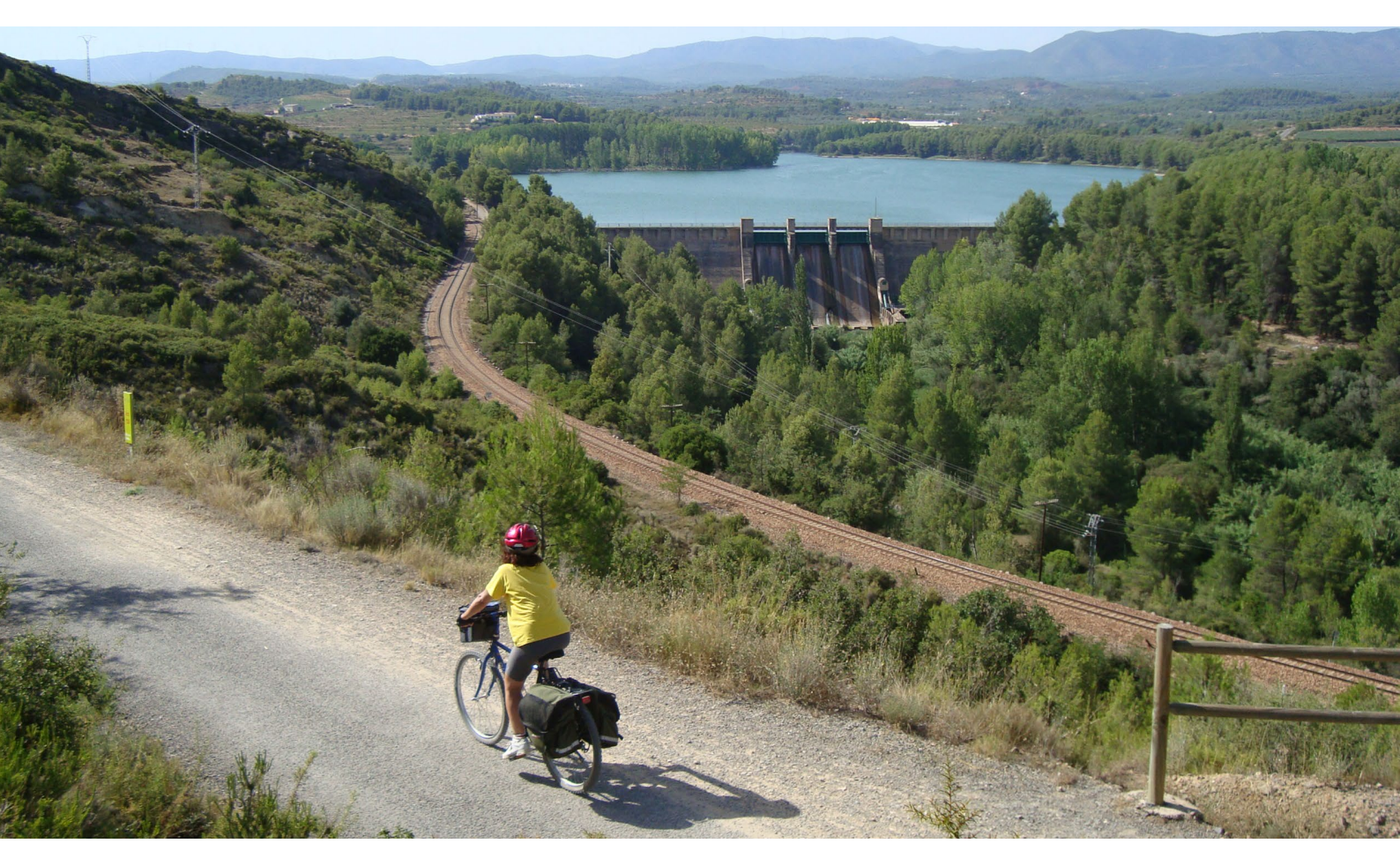
OJOS NEGRO GREENWAY CYCLING ROUTE CASTELLÓN