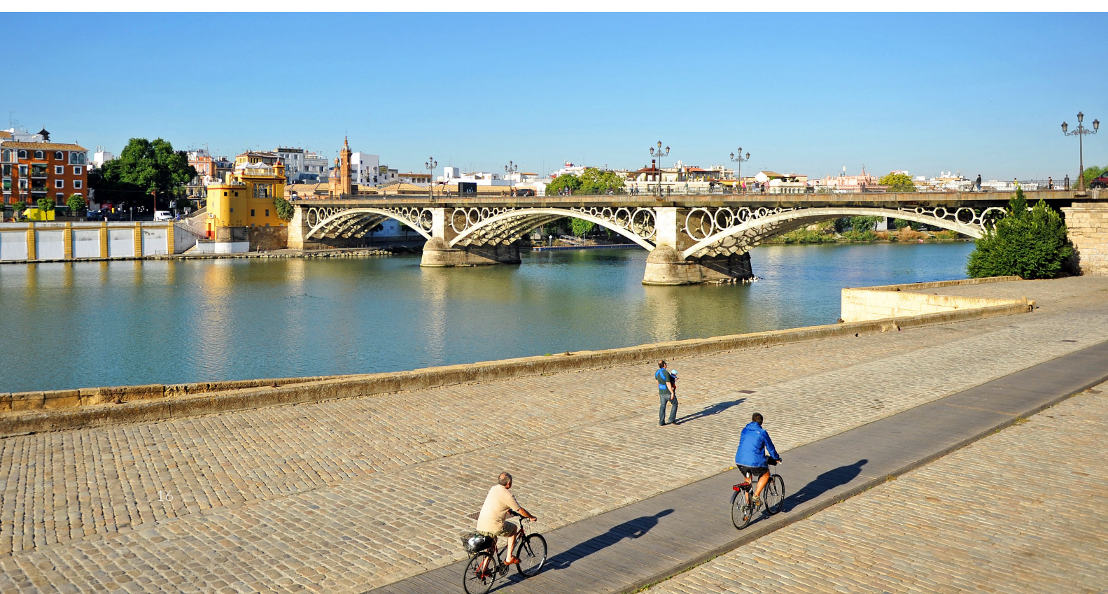
▼ PUENTE DE ISABEL II BRIDGE SEVILLE

When you are ready to take refuge in the shade you can cycle along the treelined alleys in the María Luisa Park , admire the vegetation and discover the spectacular Plaza de España . From here you can continue along the bike lane until you reach the banks of the Guadalquivir River. If you follow the river you'll be guaranteed a pleasant bike ride with the opportunity to discover more monuments and green areas, like the Alamillo Park on the Island of La Cartuja .