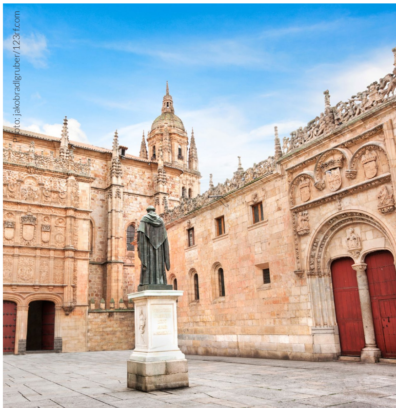
▲ UNIVERSIDAD DE SALAMANCA

The Universidad de Salamanca , one of the oldest in Spain, has the longest tradition and highest prestige when it comes to the teaching of Spanish.