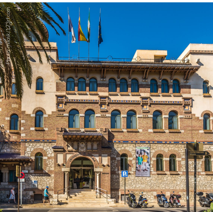
▲ UNIVERSIDAD DE MÁLAGA