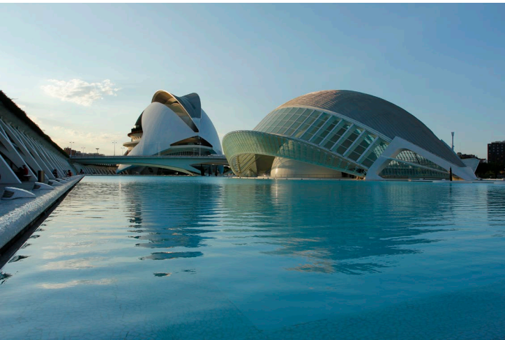
▲ CITY OF ARTS AND SCIENCES VALENCIA

Valencia , a city full of contrasts and the essence of all that is Mediterranean. Visit the historical old town as well as the amazing avant-garde buildings in the city. You'll be amazed by the City of Arts and Sciences , one of the largest scientific and cultural complexes in Europe.