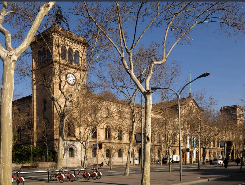
▲ UNIVERSIDAD DE BARCELONA

This truly cosmopolitan and open-minded city has a privileged geographical location. Its cultural and leisure attractions will make your stay there an unforgettable experience. Barcelona has some of the most prestigious universities in Spain, like the Pompeu Fabra, the Universidad de Barcelona and the Autónoma de Barcelona.