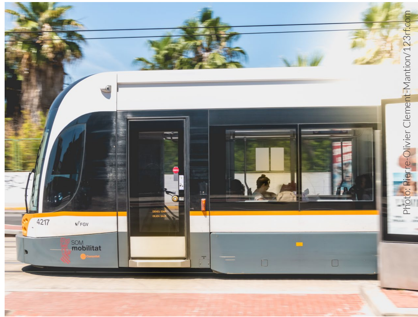
▲ TRAM VALENCIA

📍 For further information, go to www.studyinspain.info and www.spain.info