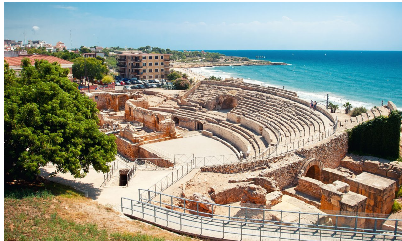
▲ ROMAN AMPHITHEATRE TARRAGONA

The Roman presence in Spain lasted over six centuries, so it is easy to find remains of their legacy practically anywhere in the country. There are especially significant archaeological remains in Tarragona and in Sagunto (Valencia) which preserve gems from their Roman past like forums, amphitheatres and theatres. Segovia is home to a prodigious feat of engineering, the Roman aqueduct, one of the best preserved in Europe.