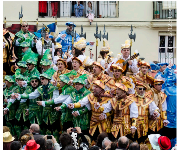
▲ CARNIVAL IN CÁDIZ

When is time for Las Fallas, Valencia as a whole is devoted to the music and its most international festival, declared UNESCO Intangible Cultural Heritage. For several days, its streets are filled with "ninots" (gigantic structures made of wood, cardboard and plaster, all based on socially critical humour) which end up as spectacular bonfires.