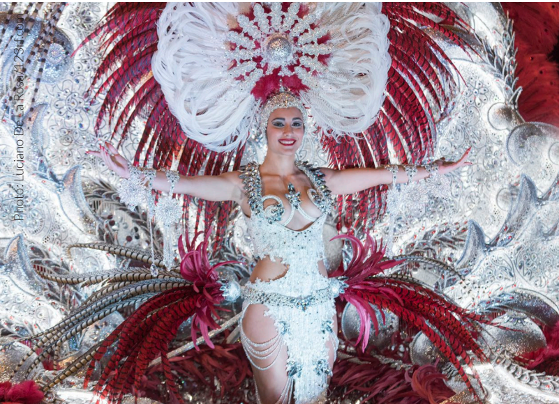
▲ CARNIVAL IN TENERIFE

In Spain you'll find popular festivities at any time of the year. Come and experience all the enjoyment of Spain through its festivities.