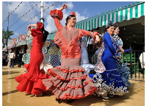
▲ APRIL FAIR SEVILLE

Seville during the April Fair is synonymous with fun at all hours. The fairground and the marquees fill with music, laughter, food, and glasses of dry sherry or "rebujito" (manzanilla wine with fizzy lemonade). Don't go without trying the typical "pescaíto frito" (fried fish platter) and make sure you get to see the spectacular parade of horses and horse-drawn carriages.