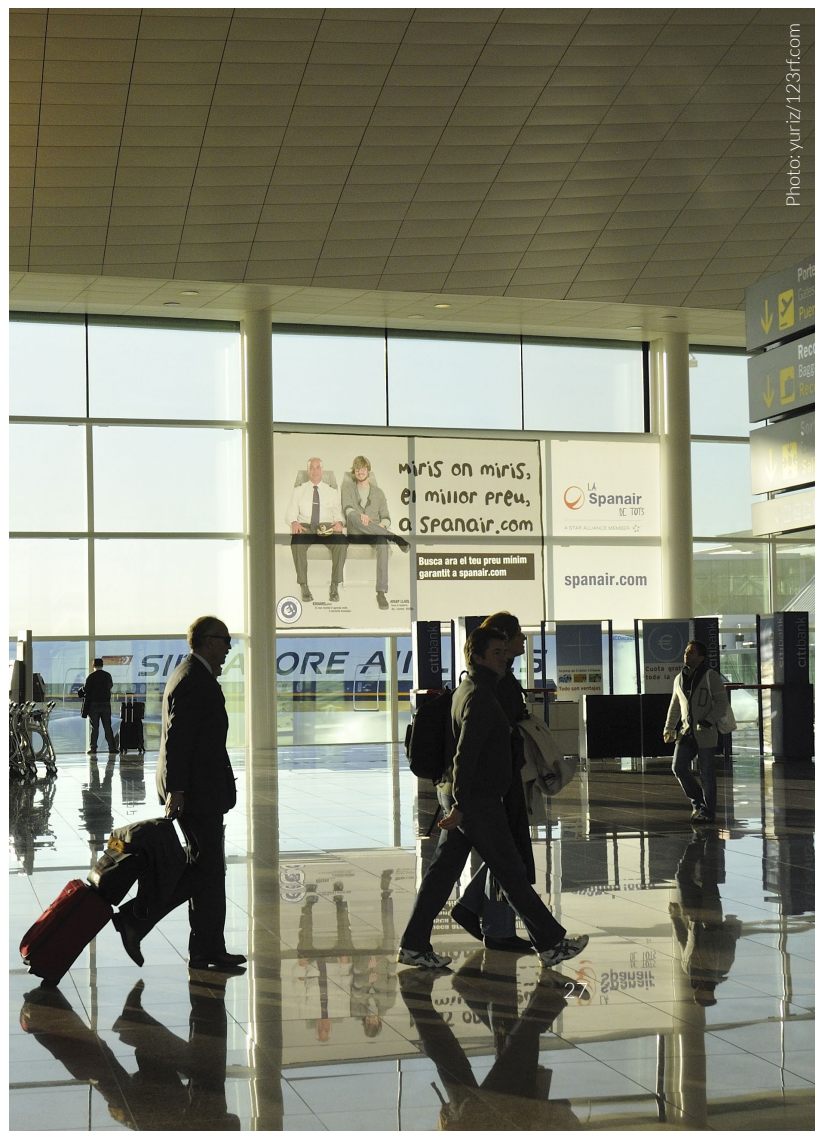
▼ BARCELONA-EL PRAT AIRPORT