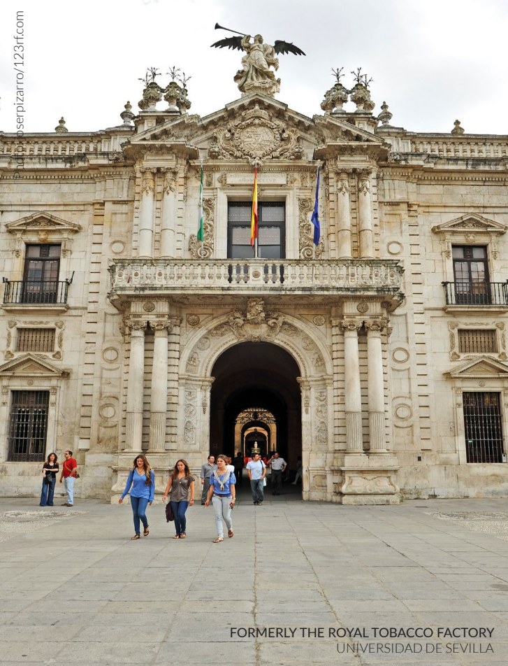
FORMERLY THE ROYAL TOBACCO FACTORY UNIVERSIDAD DE SEVILLA