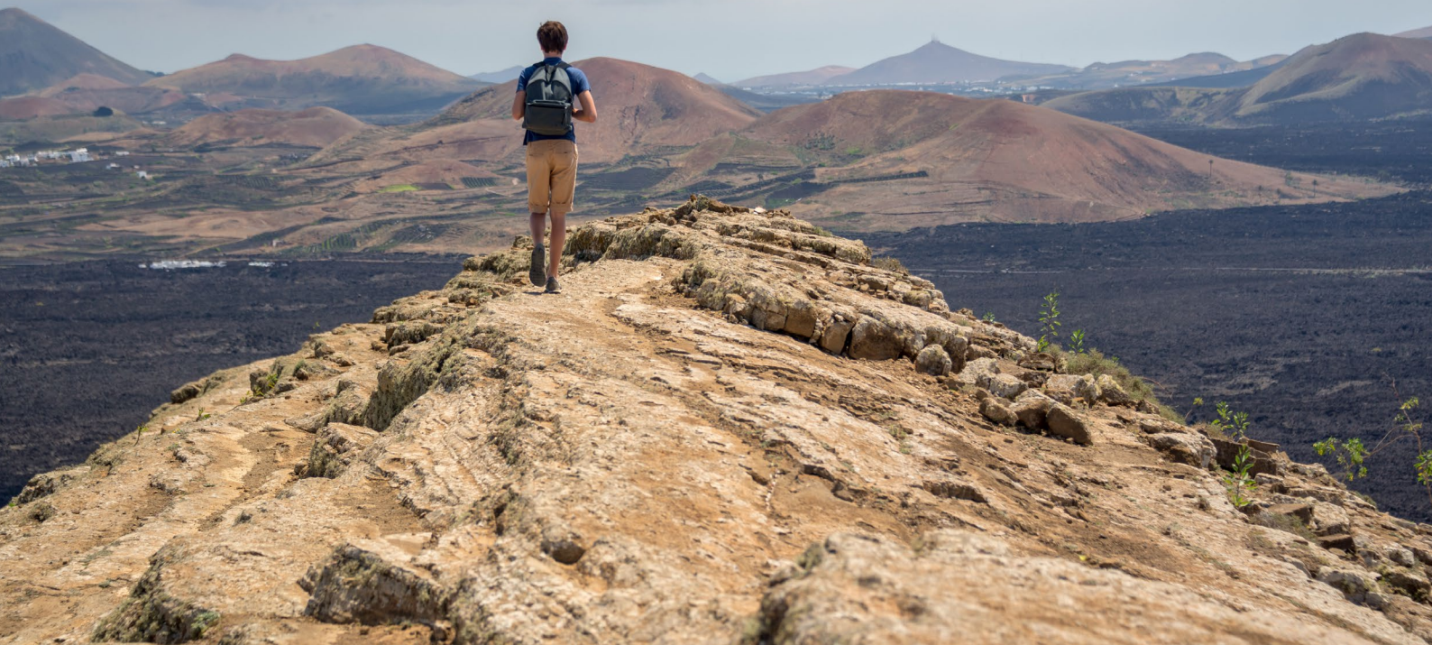
▲ TIMANFAYA NATIONAL PARK LANZAROTE