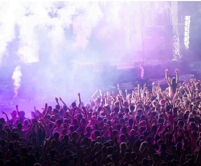
▲ GRANADA SOUND