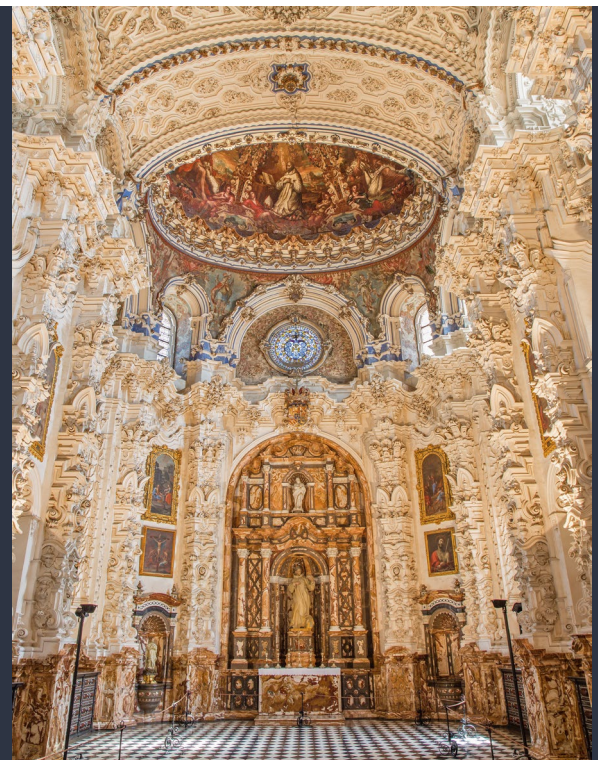
▲ LA CARTUJA MONASTERY