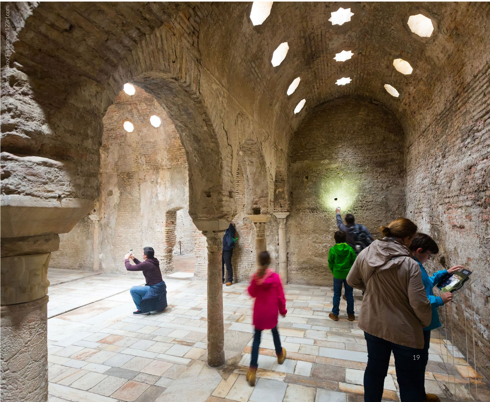
▼ EL BAÑUELO