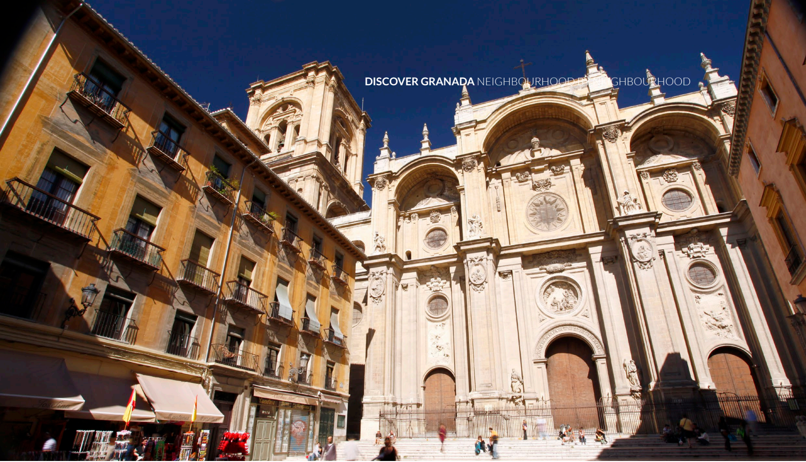
▲ CATHEDRAL OF LA ENCARNACIÓN