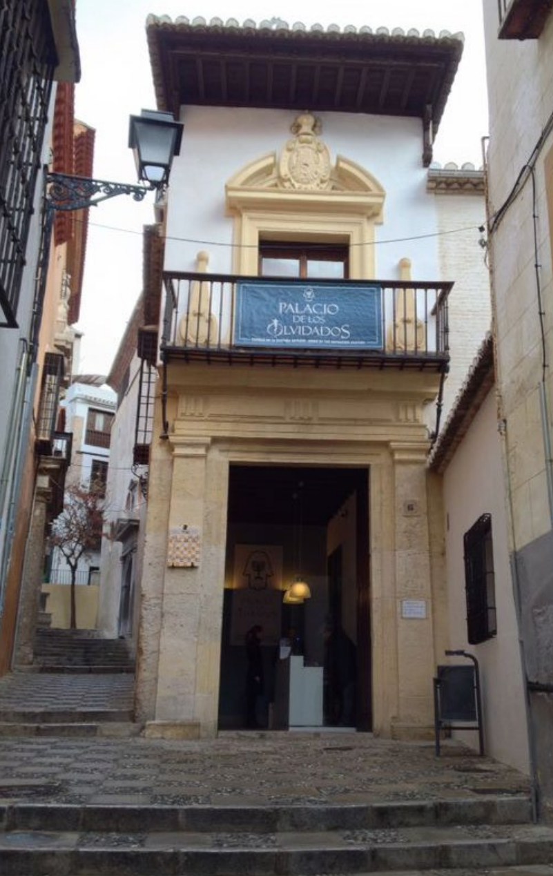
▲ PALACE OF LOS OLVIDADOS

Ministry of Industry, Commerce and Tourism Published by: © Turespaña Created by: Lionbridge NIPO: 086-17-054-7