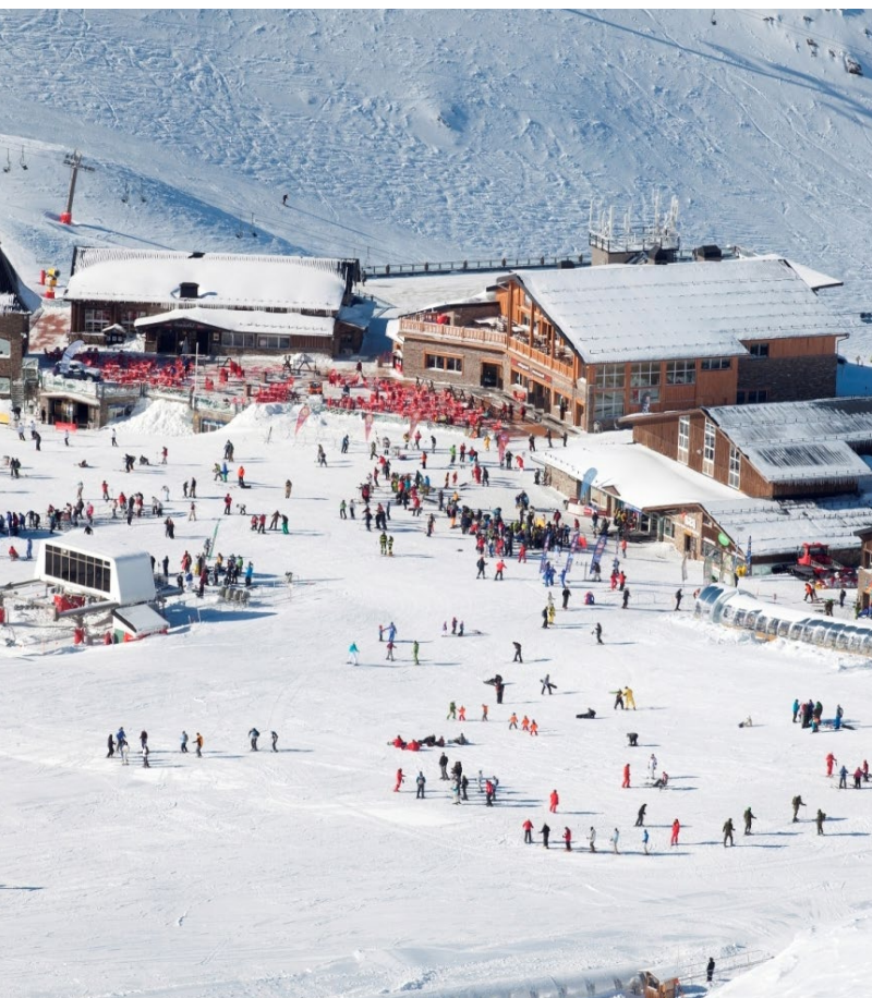
▼ SIERRA NEVADA