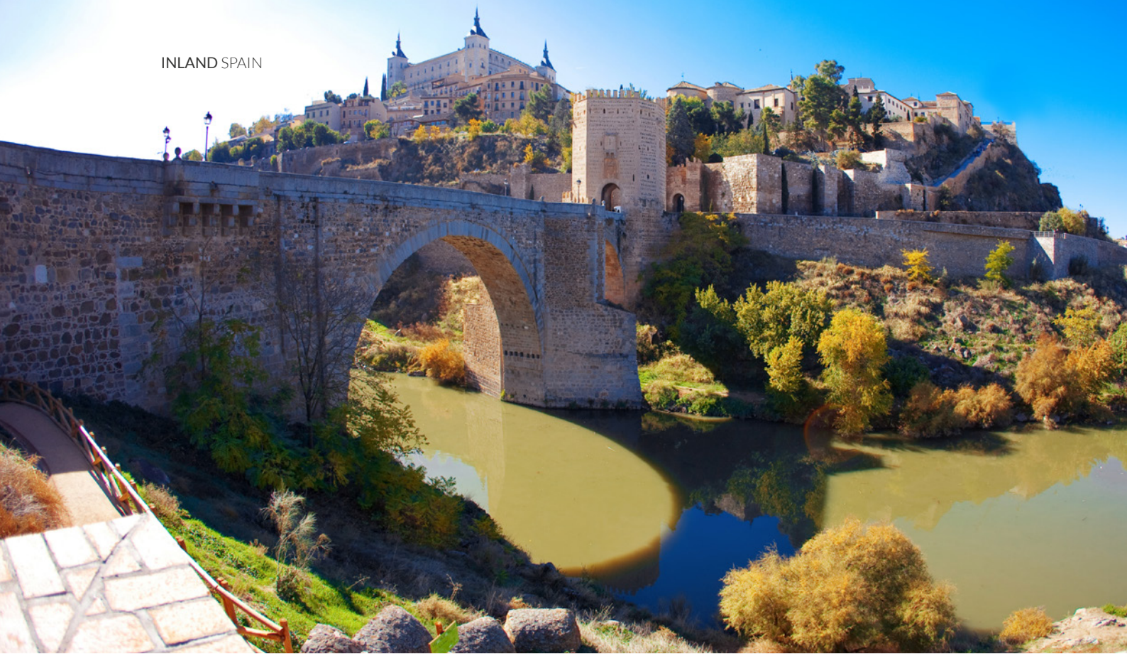
▲ ALCÁNTARA BRIDGE TOLEDO