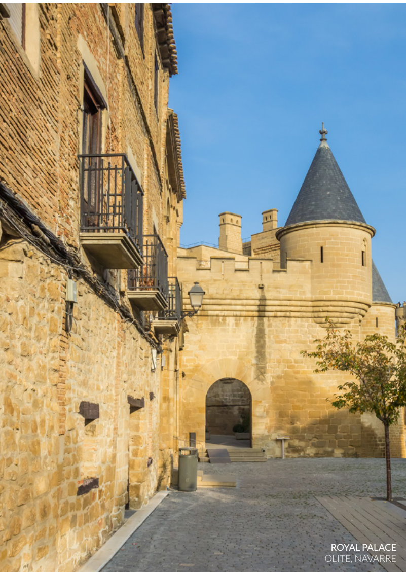
ROYAL PALACE OLITE, NAVARRE