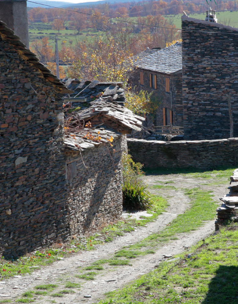
▲ CAMPILLO DE RANAS GUADALAJARA

Springtime is ideal for visiting the picturesque villages in the Jerte Valley when it is covered in a blanket of white cherry blossom.