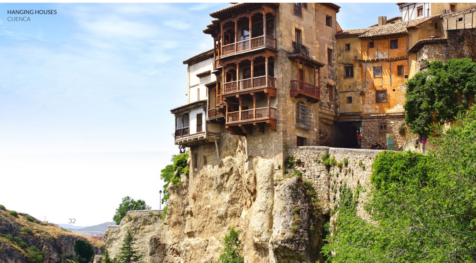
HANGING HOUSES CUENCA

balconies hanging out over the cliffs dropping down to the Huécar River. And then there's an unforgettable experience waiting for you in Toledo , the "city of the three cultures" where Christians, Moors and Jews coexisted and left a unique monumental heritage.