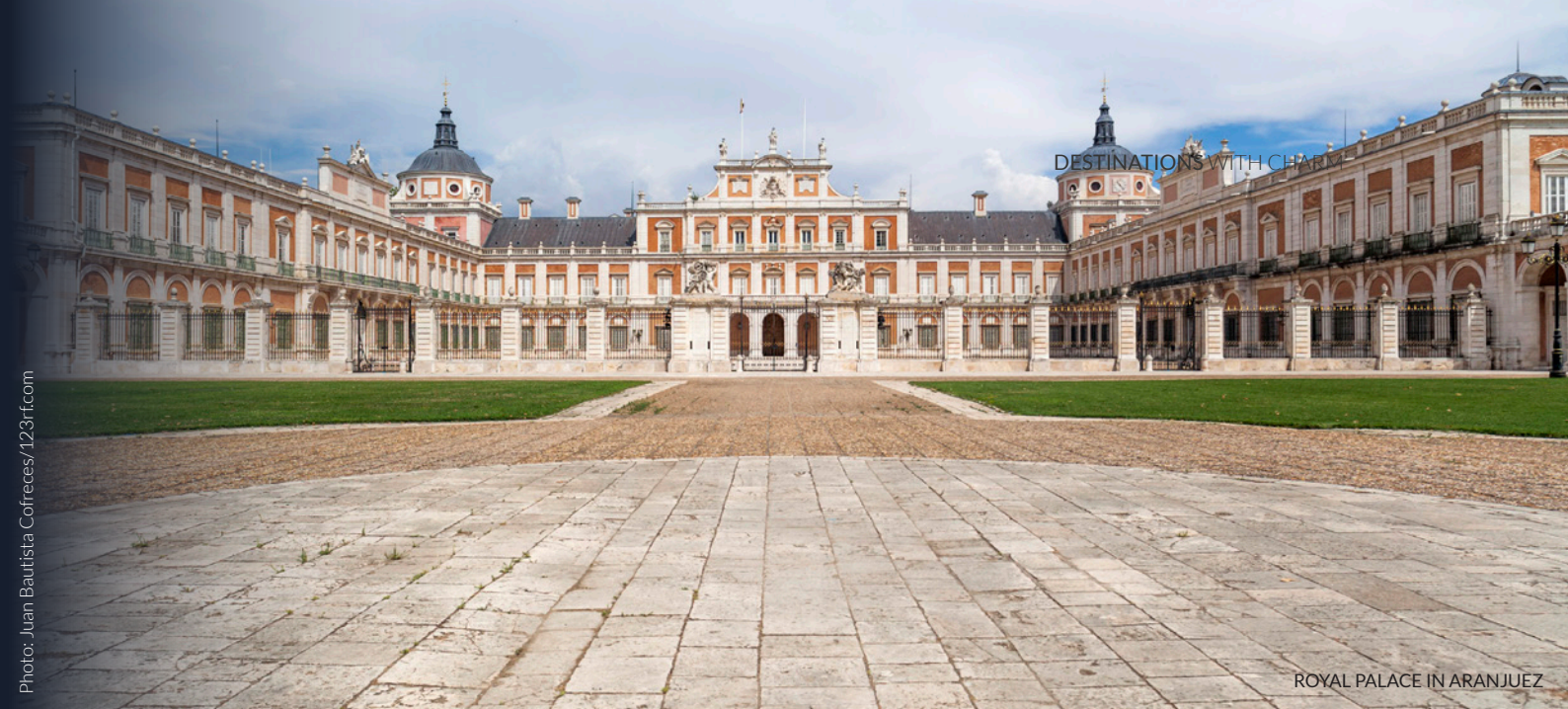
ROYAL PALACE IN ARANJUEZ