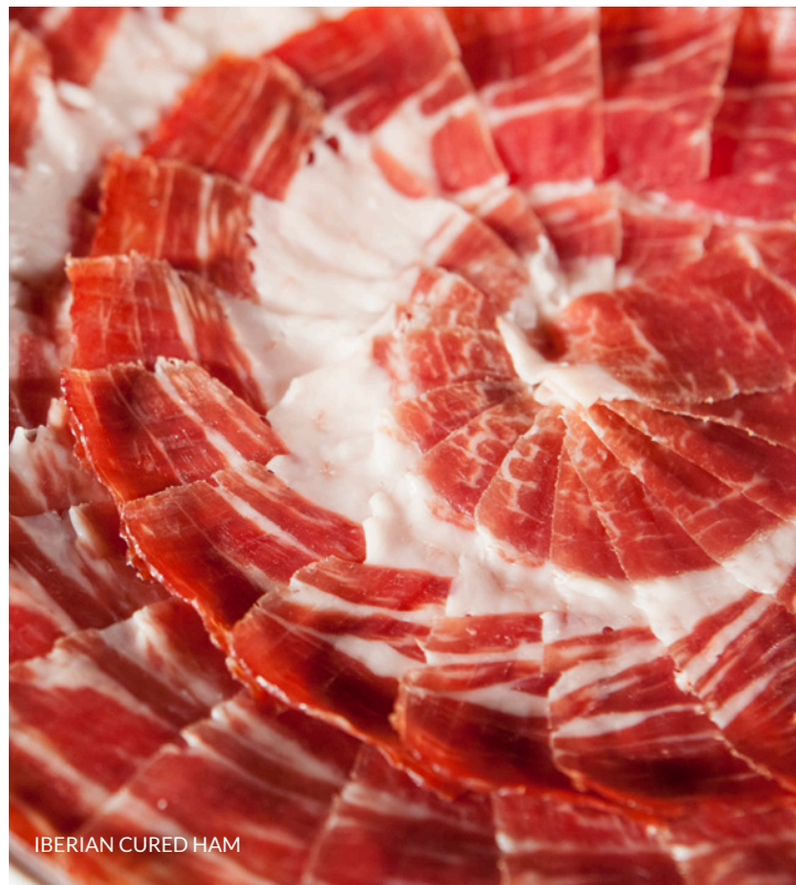
IBERIAN CURED HAM