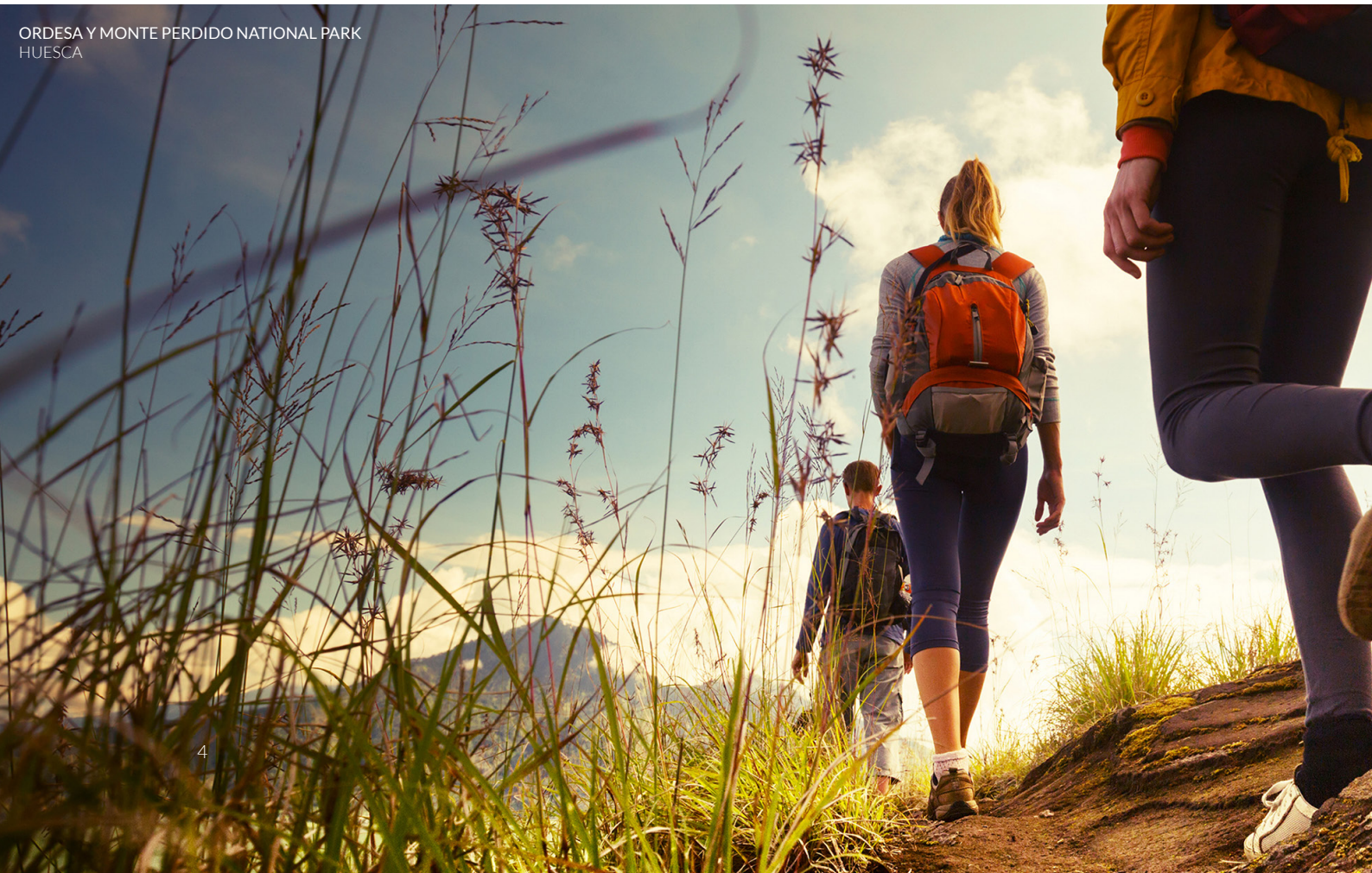
ORDESA Y MONTE PERDIDO NATIONAL PARK HUESCA

In Aragón you can also visit the city of Teruel , which preserves a significant medieval legacy. Treat yourself to some exquisite ham.