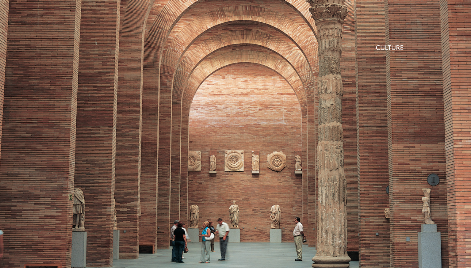
▲ NATIONAL MUSEUM OF ROMAN ART MÉRIDA

cultural experience and is one of the most lively and fresh cultural centres in Spain. You can also learn about our origins in the Museum of Human Evolution , in the city of Burgos. This spectacular, modern educational centre displays the discoveries from the renowned archaeological site of Atapuerca .