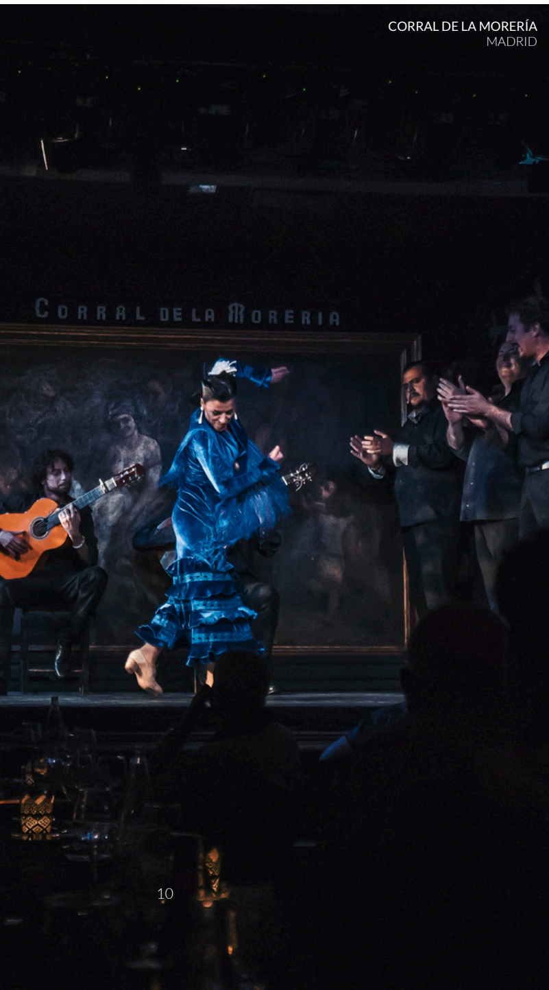
CORRAL DE LA MORERÍA MADRID