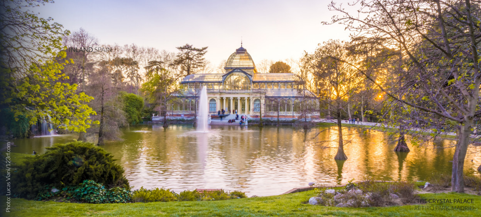
THE CRYSTAL PALACE RETIRO PARK, MADRID