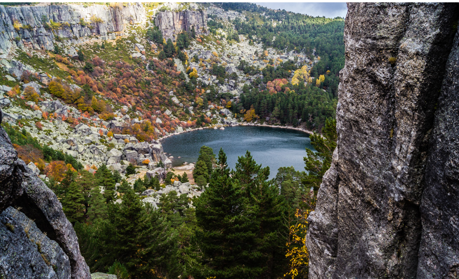
▼ SIERRA DE URBIÓN Y LAGUNA NEGRA NATURE RESERVE SORIA

The provinces of Zamora and Palencia are home to a truly impressive Romanesque legacy. Valladolid has a beautiful Renaissance old town centre and Soria is a maze of medieval streets and alleyways.