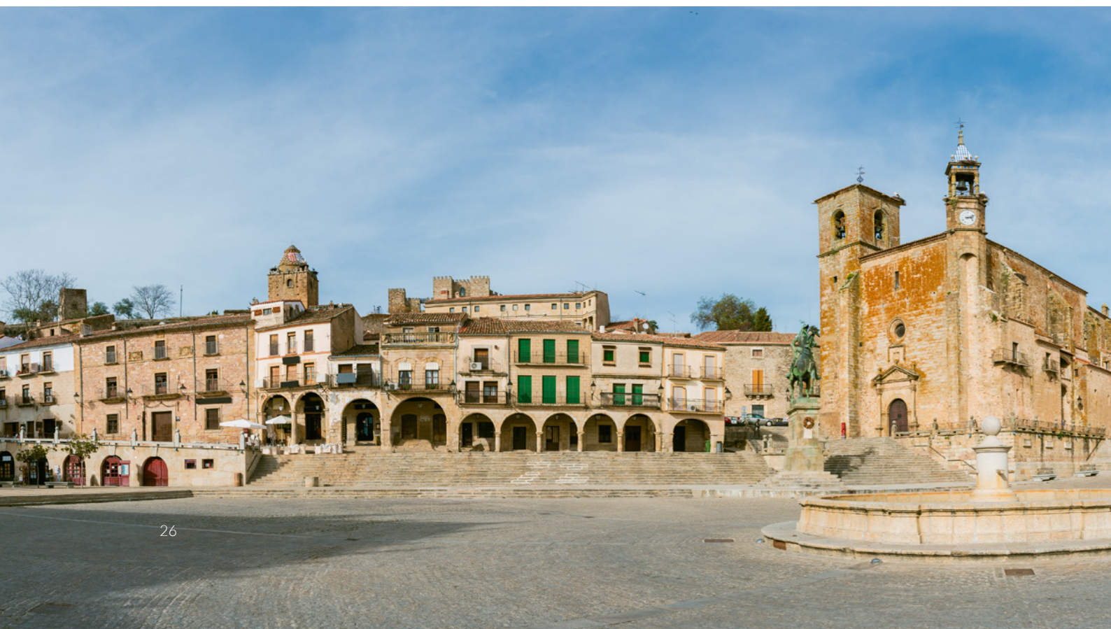
▼ PLAZA MAYOR IN TRUJILLO CÁCERES

If you're visiting Huesca (Aragón) in the summer there are two gastronomic events: the Día de la Longaniza de Graus (traditional local sausage) in July and the Fiesta del Cordero de Cerler (lamb festival) in August.