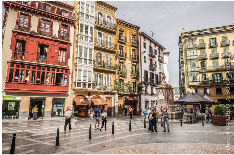
▲ OLD TOWN

In the Siete Calles area there are other iconic attractions like the 15th-century Church of San Antón , (with remains of Bilbao's original city wall under the altar) and the historical La Bolsa building, an 18th-century palace converted into a social and cultural centre.