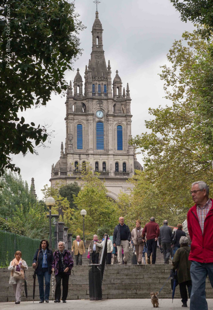
▲ BEGOÑA BASILICA