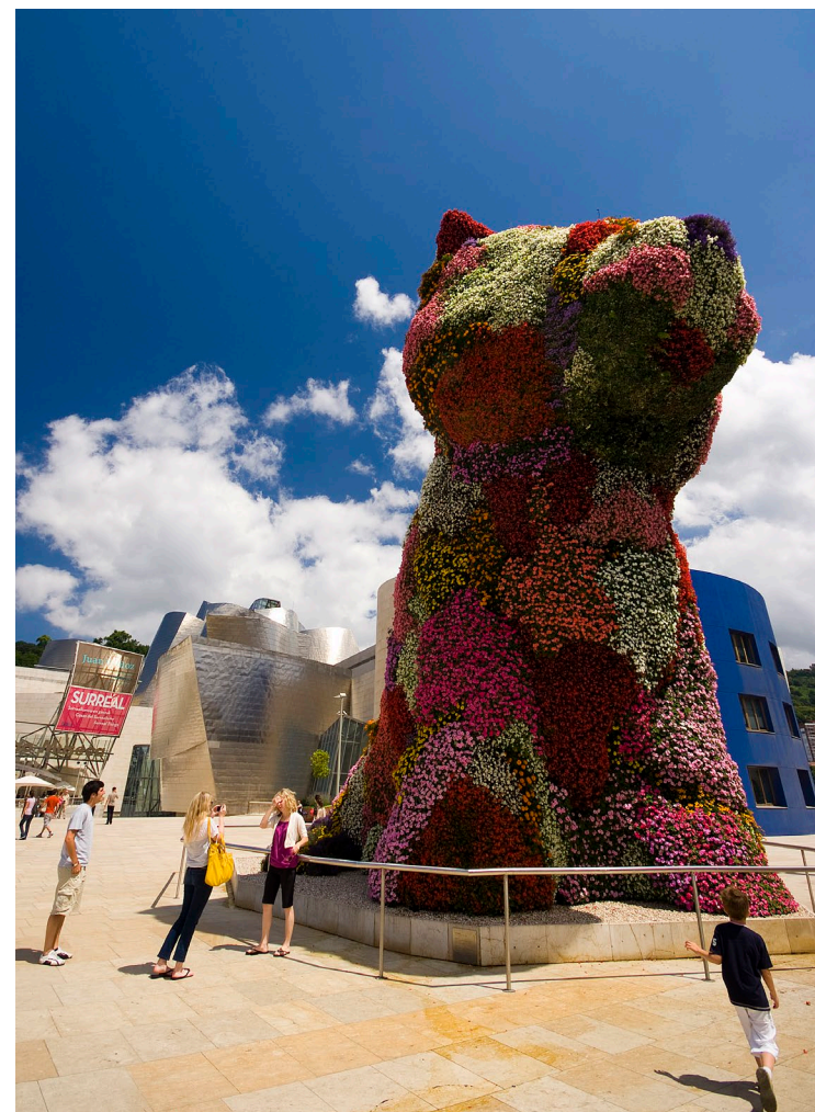
▼ GUGGENHEIM MUSEUM, BILBAO

On her saint's day, 11 October, there is a lively pilgrimage with concerts, parades, children's activities, dancing and Basque rural sports. From the Plaza de Unamuno there is a historical stair-