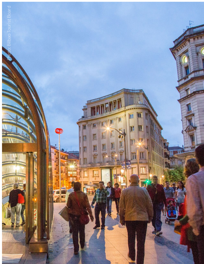
▼ PLAZA CIRCULAR

Here you can stroll along broad, grid-pattern streets which converge on squares like the Plaza Circular. Here you'll find the monumental Sociedad Bilbaína , an eclectic building, with an exquisite, English-style, exterior finish and home to Bilbao's most select and exclusive club. If you continue along the Calle Buenos Aires and cross the